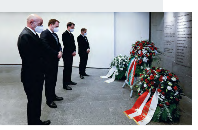
Representatives from politics and the airport commemorated the victims of the fire disaster

11 April marks the 25th anniversary of the fire disaster at Düsseldorf Airport in which 17 people lost their lives and more than 80 were injured. In the wake of the tragic events, the airport has continuously invested in preventive fire protection to ensure that such an event will never happen again. It is now regarded as a pioneer in fire protection in public buildings.